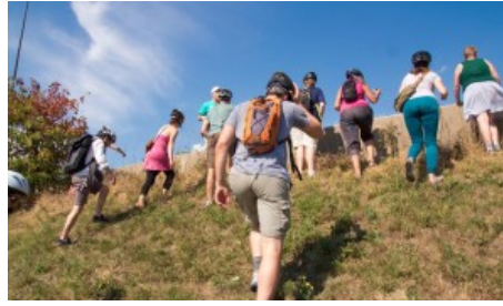
Young people participate on a tour of eastern Baltimore, investigating the architectural and social dynamics that make mundane places like the Eastern Avenue Underpass fascinating sites.